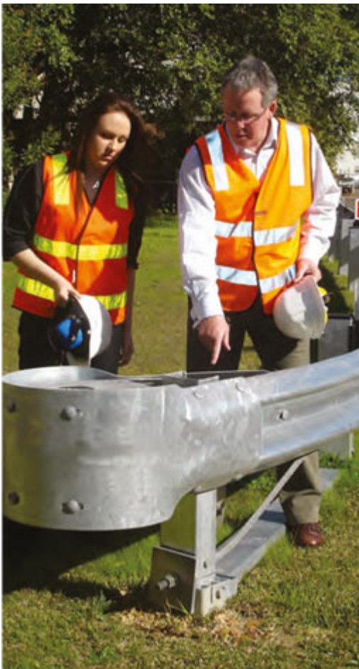
Figure 2 - Supervisor instructing apprentice

By helping trainees and apprentices with these issues in the workplace, employers and workplace supervisors are in a key position to maximise the success of training and provide skilled employees to mentor the next generation of trainees and apprentices.