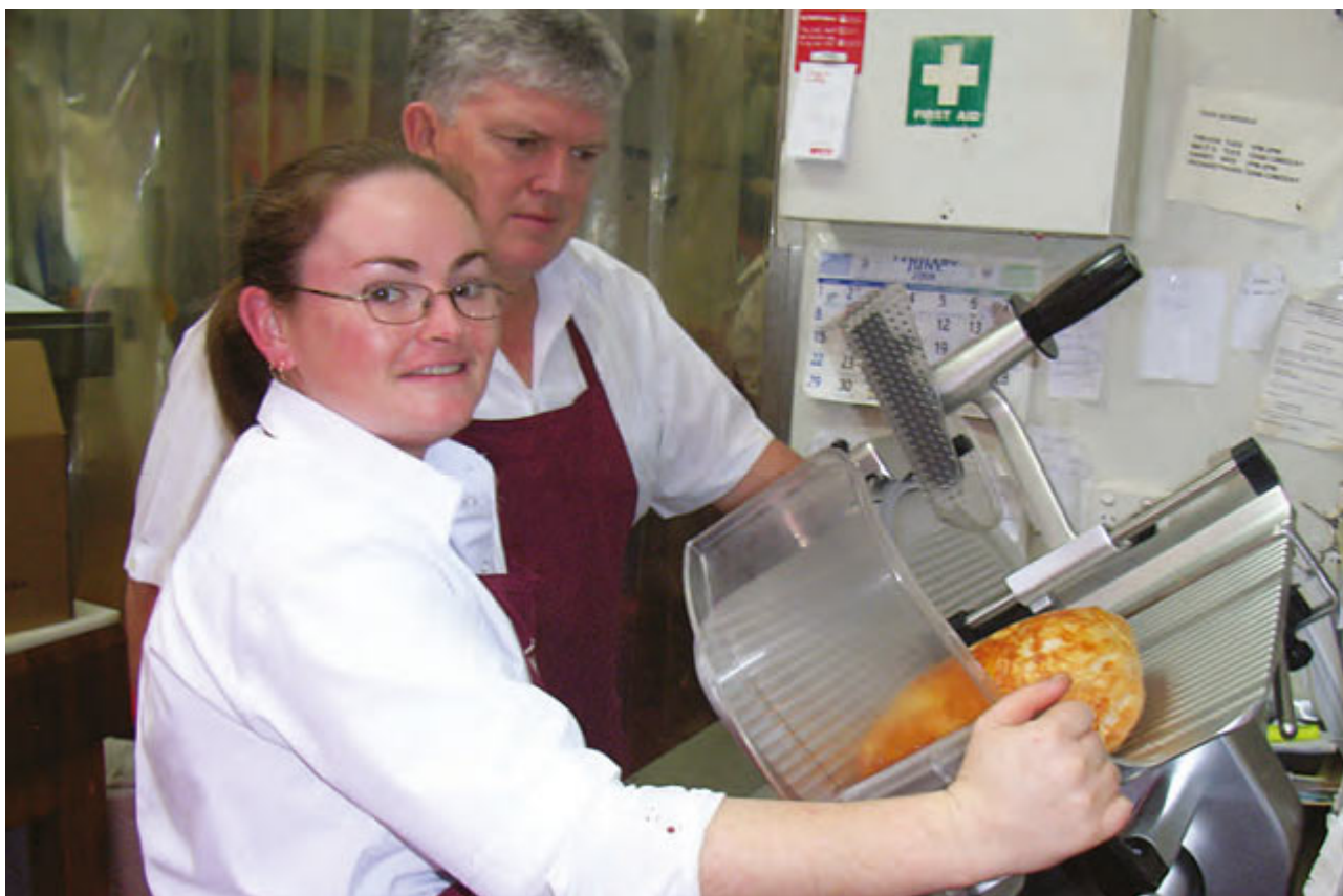
Figure 5 – An apprentice receiving instruction from a supervisor

If all the training is delivered on-the-job, the RTO may mentor and coach you to provide training in the workplace, and will be responsible for assessing the competence of your trainee/apprentice.