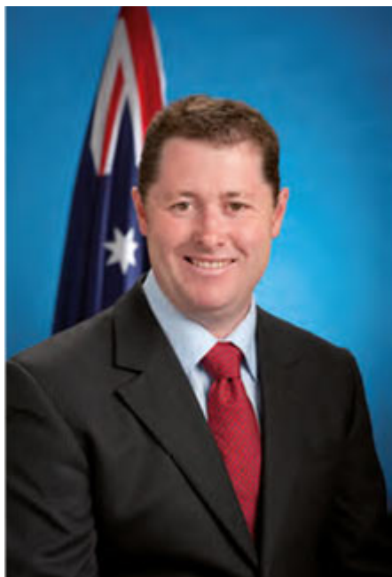
Figure 1 - Jack Snelling MP

Training the workforce of tomorrow is important to our economy and to our future prosperity. This is more important than ever, as we face skills shortages in growth areas.