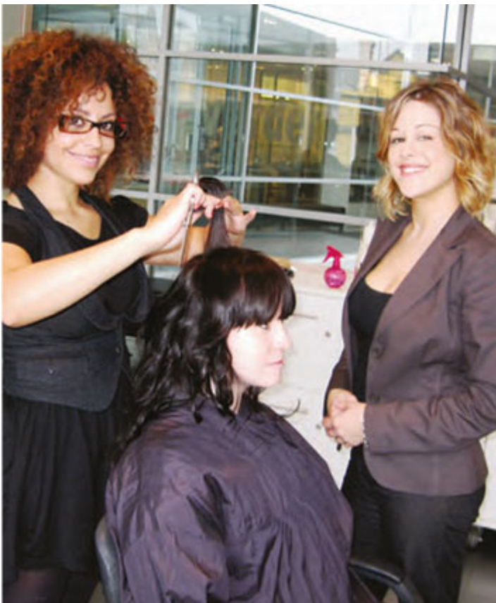
Figure 6 - An apprentice receiving instruction from a supervisor

For more information on roles and responsibilities, please consult the publication South Australia's Traineeship and Apprenticeship System , which can be obtained by calling 1800 673 097 or by going to www.skills.sa.gov.au/apprentices